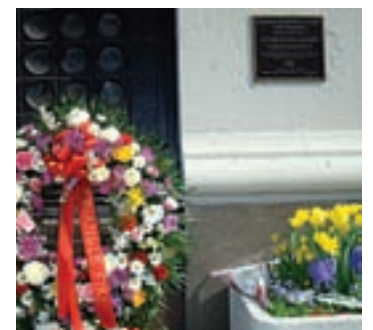
NYU's Brown Building on the corner of Washington Place and Greene Street is the site of the Triangle Shirtwaist Factory fire.

building, originally known as the Asch Building and now the Brown Building, is a National Historic Landmark of New York City. ■