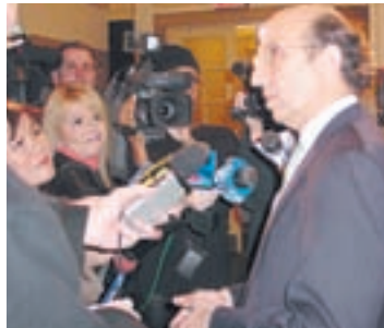
Reporters surround Chancellor Joel Klein at a Steinhardt policy breakfast on the Bloomberg restructuring of NYC public education.

Joel Klein, chancellor of the New York City Department of Education, will receive The Lewis Rudin Award for Exemplary Service to New York City at NYU's Commencement ceremony. The chancellor will be honored for his leadership in education, his efforts at transforming the nation's largest public school systems, and for "assuring New York City families of their essential right to access better, safer, and higher quality schools." ■