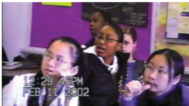
Figure 1. Evidence of mutual focus from eye gaze and body orientation toward the demonstration and ensuing conversation. Note the apparent synchrony of eye gaze and body positioning of each person toward each other as they focus on the inverted cup demonstration. [Color figure can be viewed in the online issue, which is available at www.interscience.wiley.com .]

suggest a verve and energy in the classroom conversation that was lacking when this series of interactions began. Such synchrony in responses reinforces our argument that these interactions are supporting an emerging mutual focus and shared mood, ingredients necessary for the development of interaction ritual chains and positive emotional energy, a precursor for student engagement.